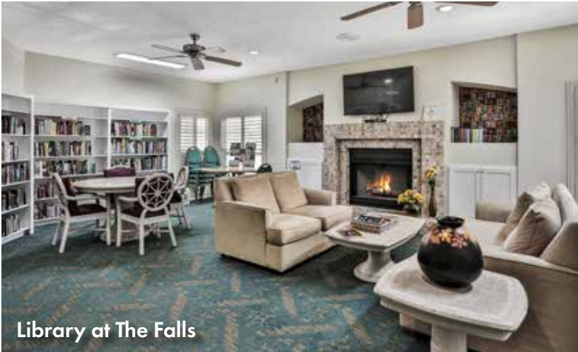
Library at The Falls