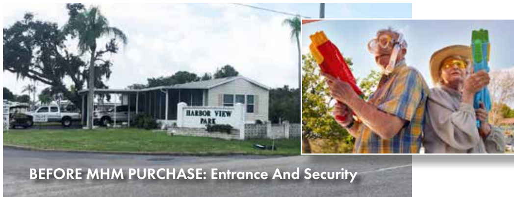
BEFORE MHM PURCHASE: Entrance And Security

Most 55+ communities the size of yours want gated entrances with easy entry key fobs for the residents and a call box for guests, so whenever possible, we provide them. Gated entrances raise the value of the homes and give the residents peace of mind. Decorative security fencing would be installed at each access to the community. The current fencing would be assessed to determine whether it needs to be added to, repaired, or replaced for additional safety.