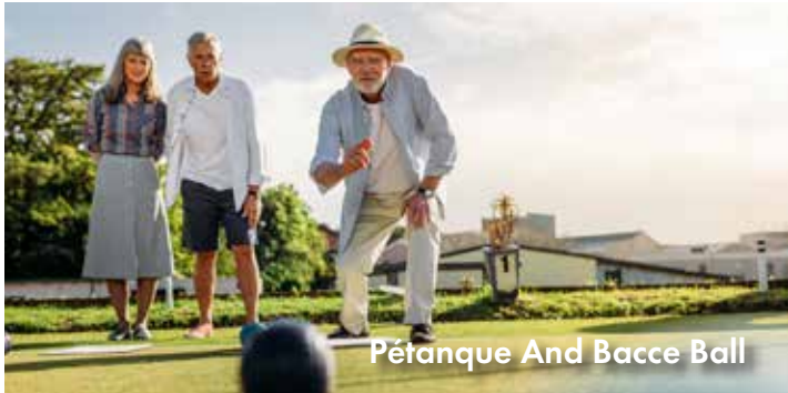
Pétanque And Baccé Ball