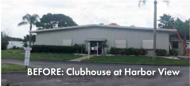
BEFORE: Clubhouse at Harbor View

Adding well-appointed landscaping at the entrances and in areas throughout the community builds community pride and sets the tone for the homeowners and guests.