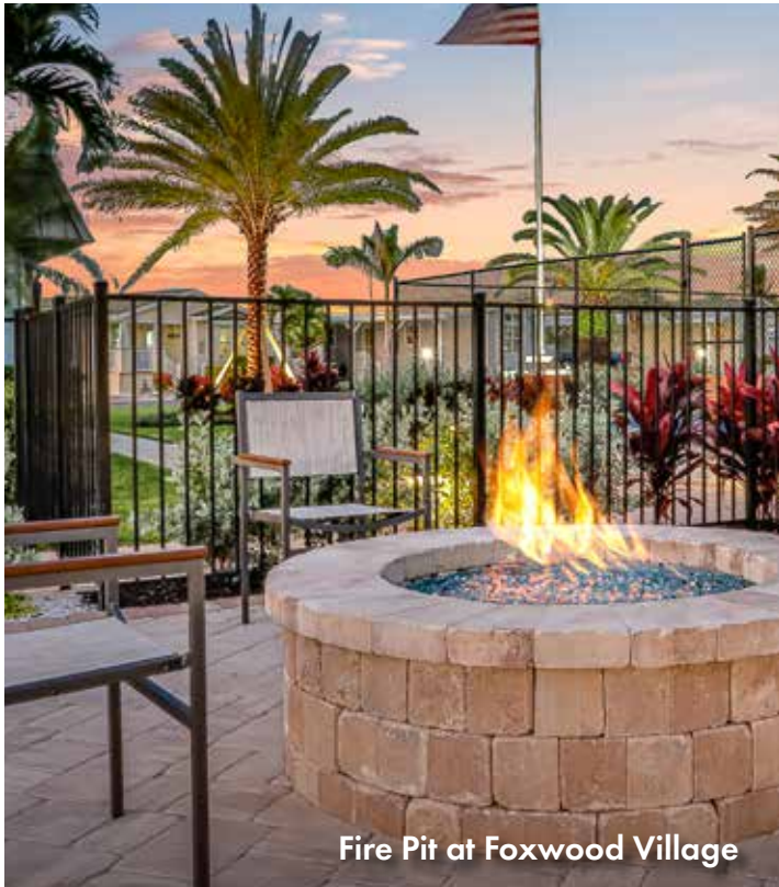
Fire Pit at Foxwood Village