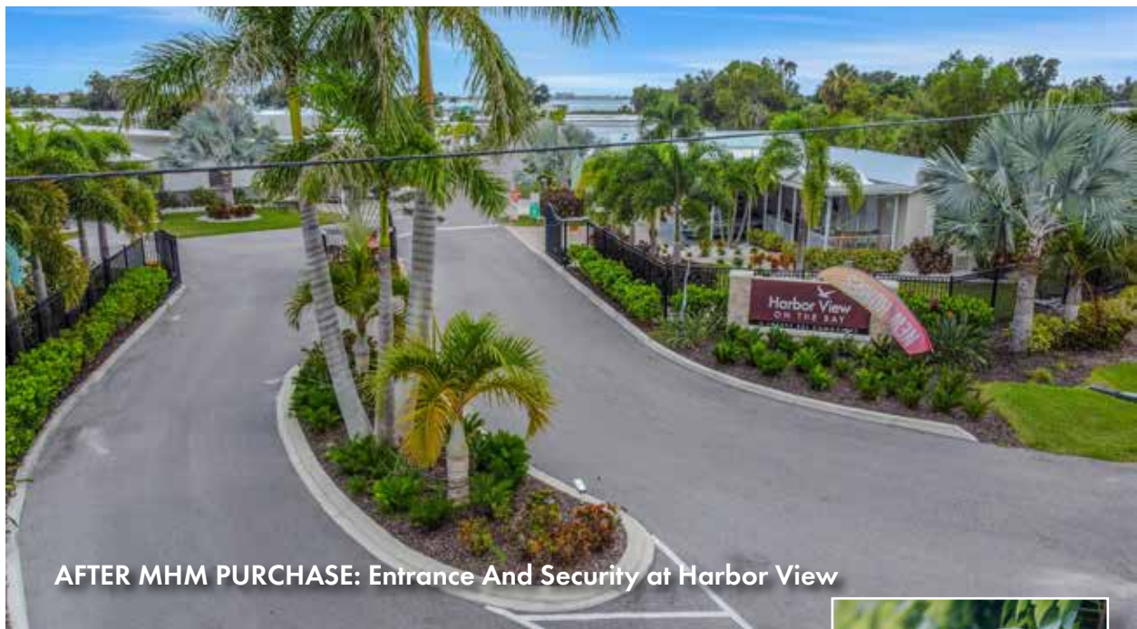
AFTER MHM PURCHASE: Entrance And Security at Harbor View

Day/Night security cameras would be installed at the entrances and at other places throughout the community where needed. These cloud-based cameras would record time-stamped images of drivers, vehicles, and tag numbers of anyone entering and exiting the community.