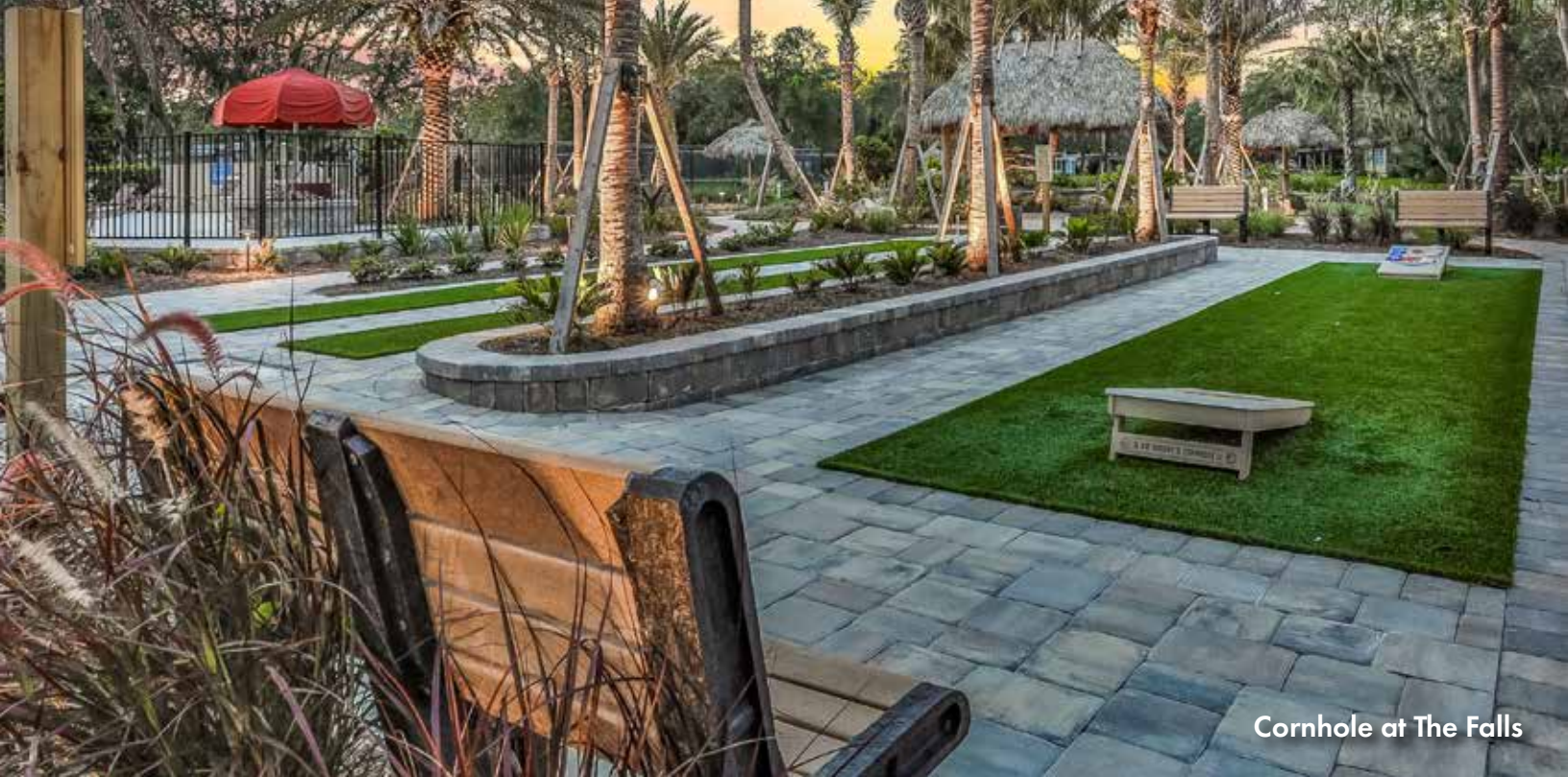
Cornhole at The Falls