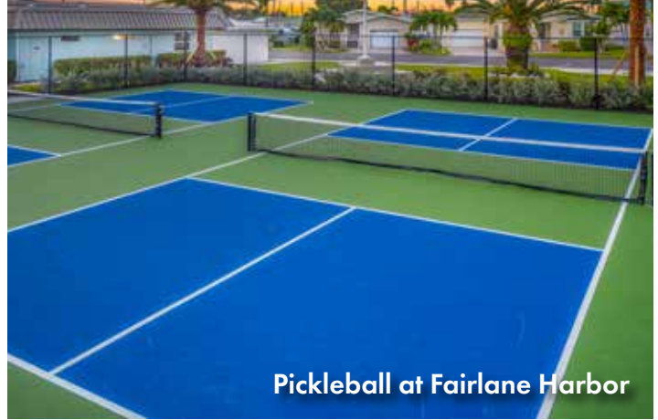
Pickleball at Fairlane Harbor