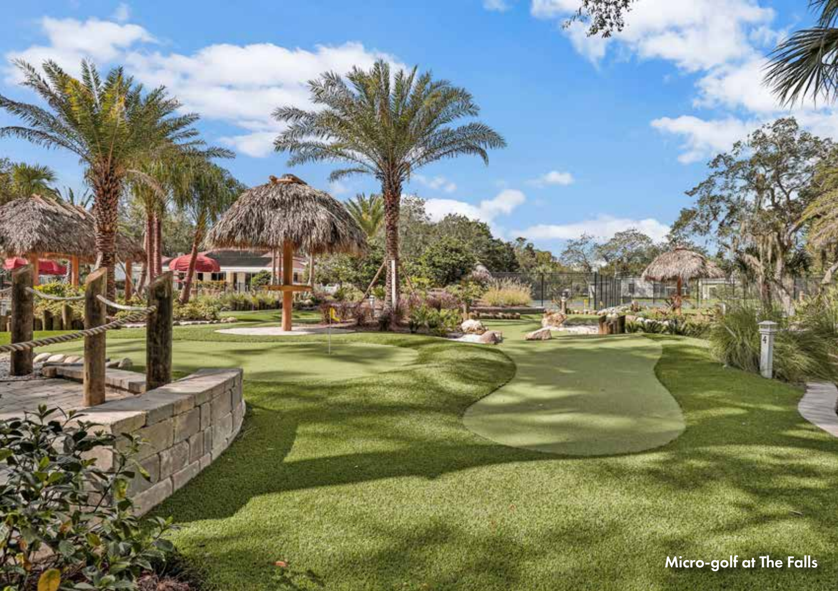
Micro-golf at The Falls