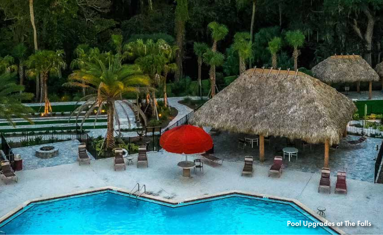
Pool Upgrades at The Falls