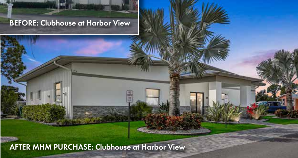
AFTER MHM PURCHASE: Clubhouse at Harbor View