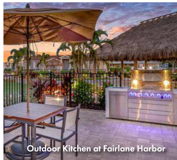
Outdoor Kitchen at Fairlane Harbor