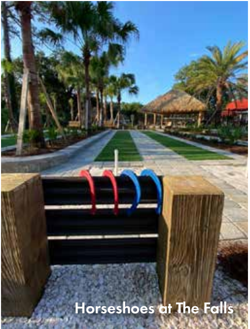
Horseshoes at The Falls